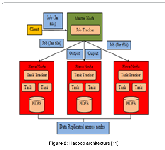
Figure 2: Hadoop architecture [11].

particular node in the group. User submits task to the Jobtracker. When the task is finished, the Jobtracker informs its status. User applications can request the Jobtracker for data.