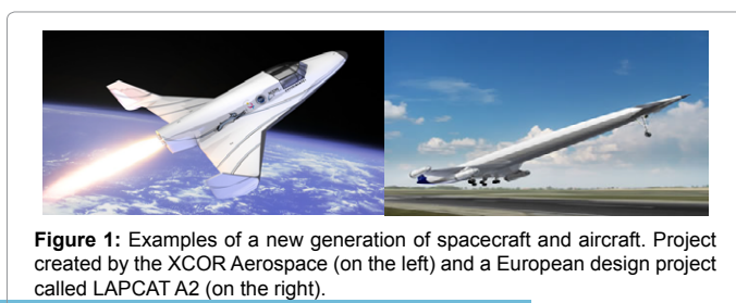
Figure 1: Examples of a new generation of spacecraft and aircraft. Project created by the XCOR Aerospace (on the left) and a European design project called LAPCAT A2 (on the right).