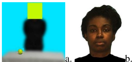
Figure 3. An example of a test scene from Experiment 2. Participants saw scenes similar to (a). Beneath was a face, similar to (b). Participants judged if the face matched the scene.

Test phase. Participants saw a scene similar to one presented at study (see Figure 3 for an example), except that everything besides the cue was blurred and the face of the actor was covered by a green square. Below this scene was a single face (either a target or a lure).