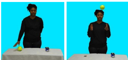
Figure 1. Example of a study pair.

Study phase slides. A series of 36 slide pairs were used for the current study. Each pair consisted of: A start scene in which an actor is reaching for an object and an action scene in which they are performing an action (see Figure 1 for an example).