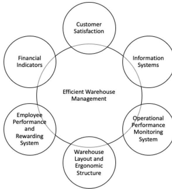
Figure 2. Research Model

compatible with the data (Şimşek, 2007). The CFI value is .90 and SRMR value was found .05, which shows that the 6-factor structure of the question list formed as a result of confirmatory factor analysis yields acceptable and valid results (Lacobucci, 2010). After the reliability and validity analyzes, the established model of the research is given in Figure 3.