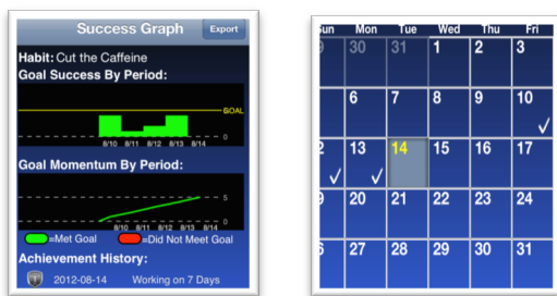
Figure 2: Reflection tools used by P6 (Depression)